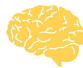
Brain at 1 year 0.97 kg